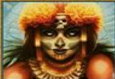
TALTECUHTLI Goddess of Chaos