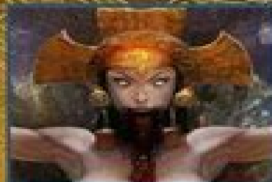
MICTECACIHUATL Underworld Goddess