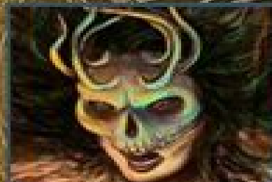
ITZPAPALOTL Warrior Goddess