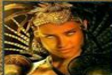
TLAZOLTEOTL Goddess of Purification