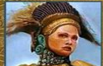
CHICOMECOATL Goddess of Maze