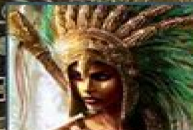
TONANTZIN Mother Goddess