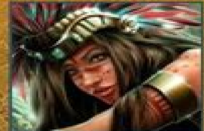
MAYAHUEL Fertility Goddess