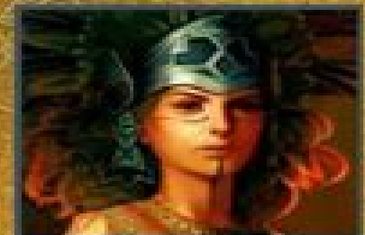
COYOLXAUHQUI Moon Goddess