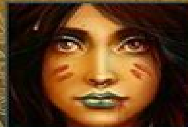
XOCHIQUETZAL Goddess of Pleasure