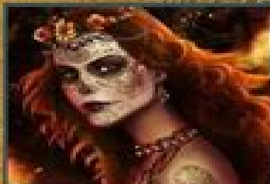
CHANTICO Fire Goddess