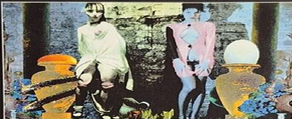
Paint © Steve Biderstorf