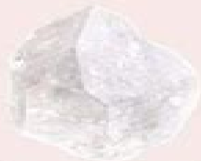
Clear Quartz Focus