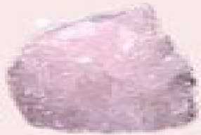
Rose Quartz Love