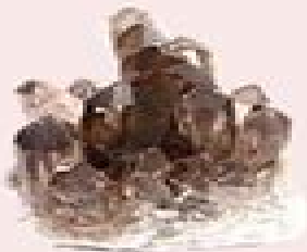
Smoky Quartz Balance