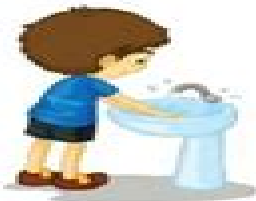
WASH MY FACE