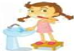
BRUSH MY TEETH