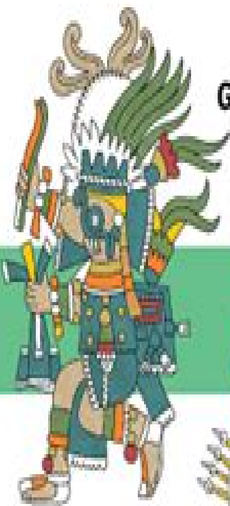
Tlaloc God of Rain