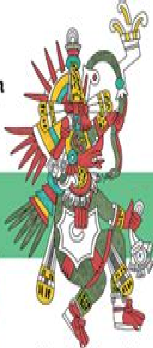
Quetzalcoatl God of Civilisation and Order