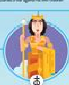
HERA Goddess of marriage and family