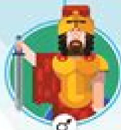
ARES God of war