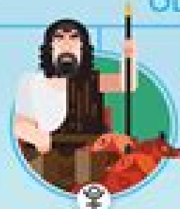
HADES God of the underworld