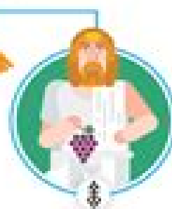
DIONYSUS God of the grape harvest, intoxicating, and wine