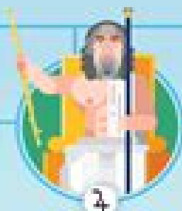
ZEUS God of the sky, lightning, and thunder