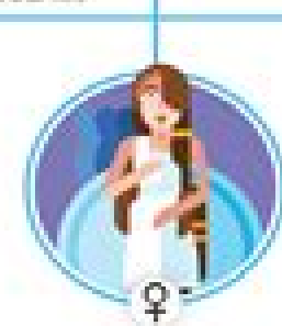
APHRODITE Goddess of love, beauty, and fertility