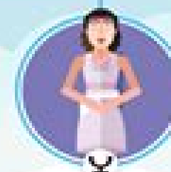
HEBE Goddess of youth