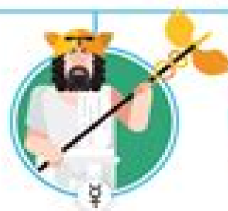
HERMES God of trade, wealth, luck, fertility, animal husbandry, sleep, language, thieves, and travel