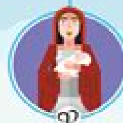
EILEITHYIA Goddess of childbirth