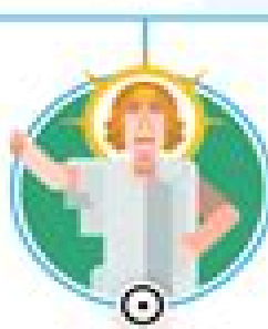
APOLLO God of music, truth, and prophecy