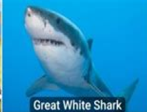
Great White Shark