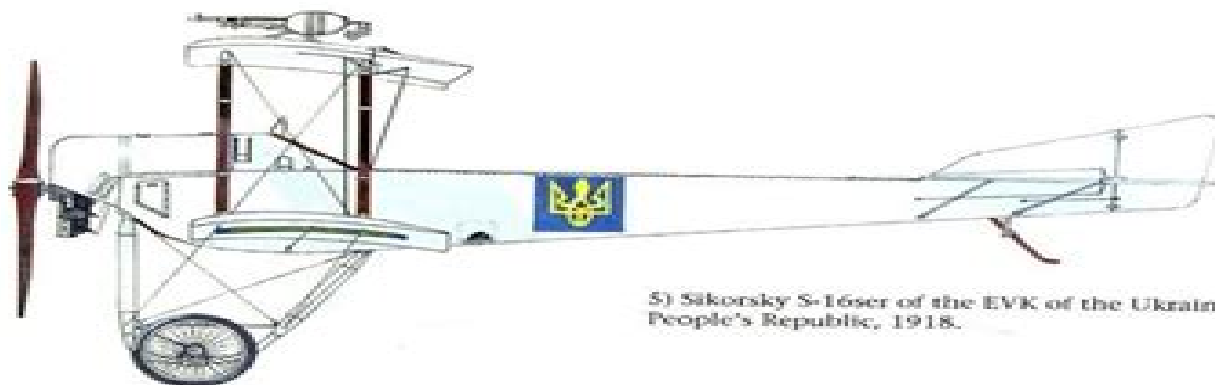
5) Sikorsky S-16ser of the EVK of the Ukrainian People's Republic, 1918.