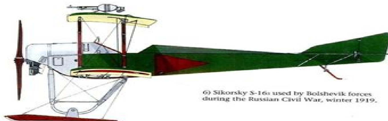
6) Sikorsky S-16s used by Bolshevik forces during the Russian Civil War, winter 1919.