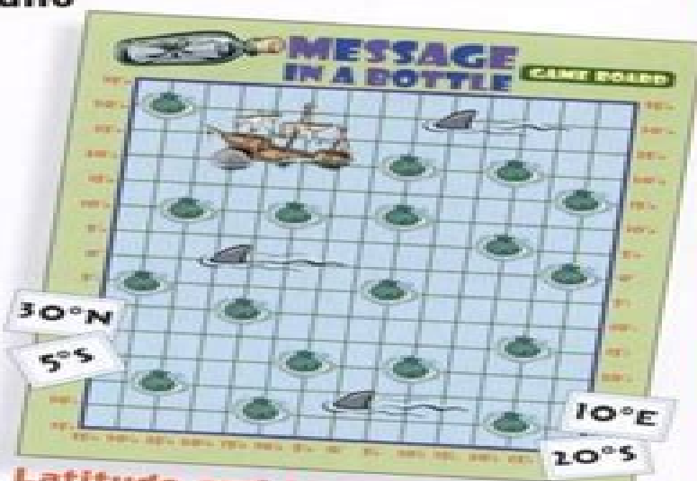
Latitude and Longitude Game