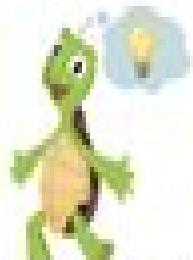
Step 4. Connect and reflect on your work.