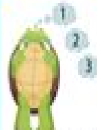
Figure 1. Key findings from the study