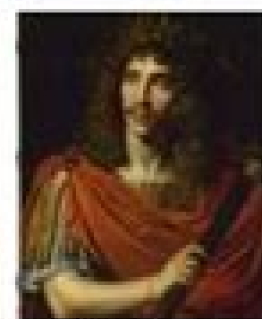
Molière (1622 - 1673)