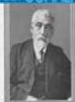
Dumas (1802 - 1870)