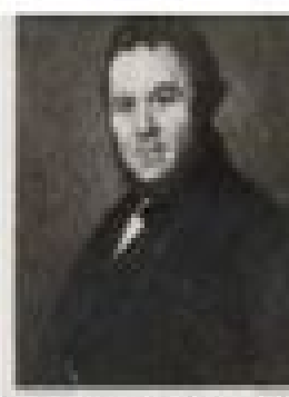
Stendhal (1783 - 1842)