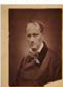
Baudelaire (1821 - 1867)