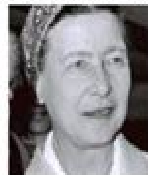
S. de Beauvoir (1908-1986)