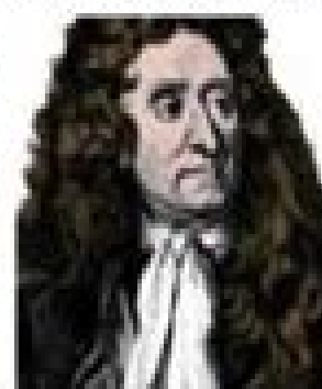
La Fontaine (1621 - 1695)