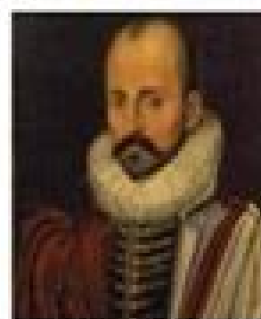
Montaigne (1533 - 1592)