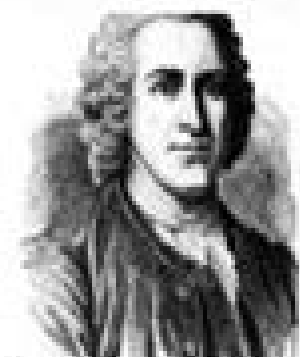
Rousseau (1712 - 1778)