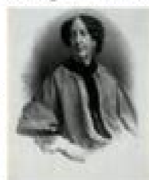
G. Sand (1804-1876)