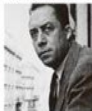
Camus (1913 - 1960)