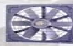
Industrial Ventilation Fan