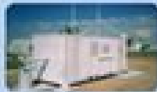
GONG Since 1995 NSF