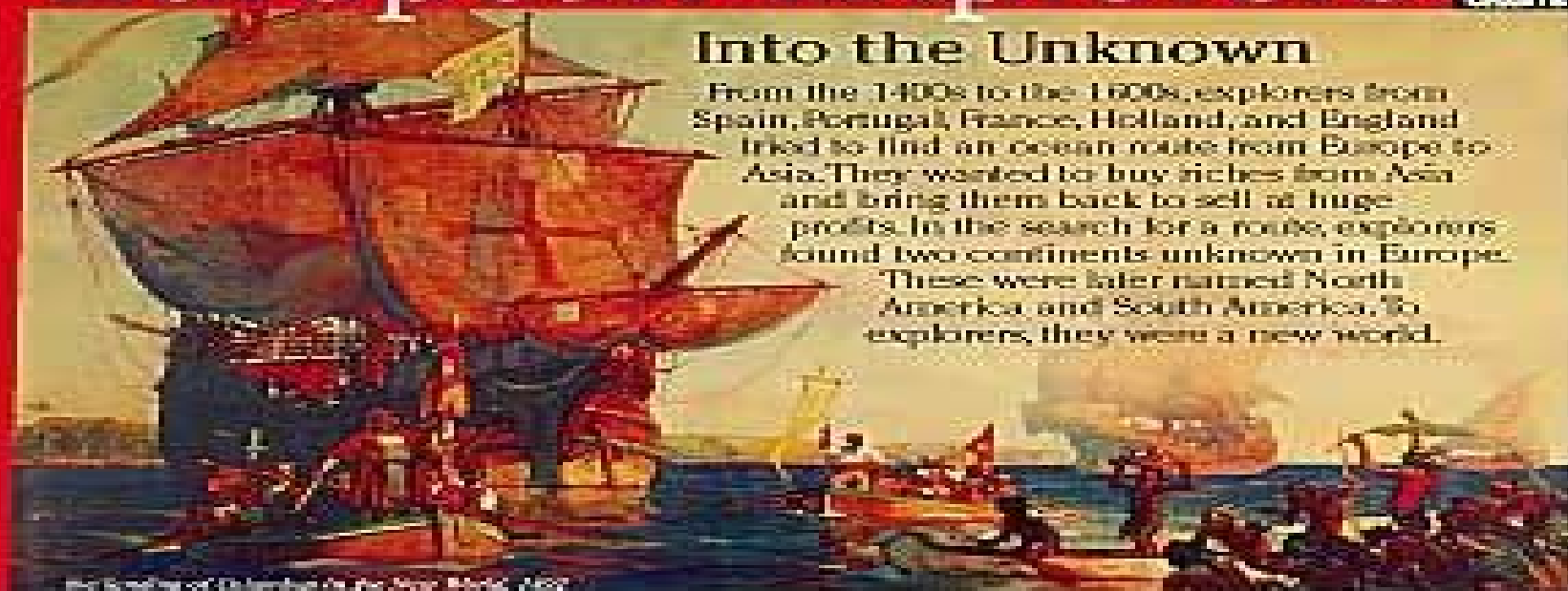
Reproduction of Columbus's ship, the Santa Maria, 1492