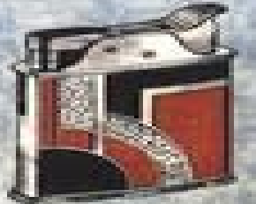
Model 1004 - Red