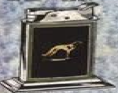
Model 1010 - Black