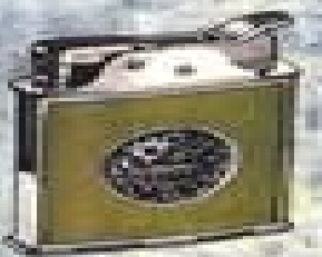
Model 1003 - Green