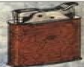
Model 1001 - Brown