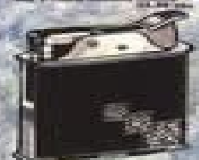
Model 1006 - Black