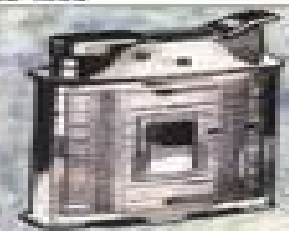
Model 1000 - Silver