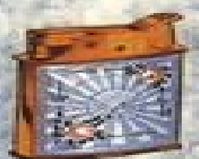
Model 1007 - Orange