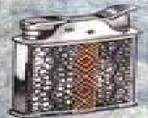
Model 1002 - Black