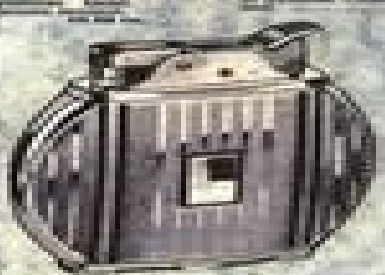
Model 1011 - Silver