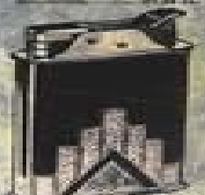
Model 1012 - Black

World's Largest Manufacturers of Style Accessories