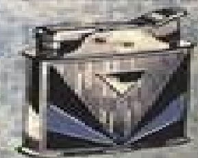
Model 1005 - Blue