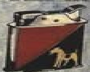
Model 1009 - Red