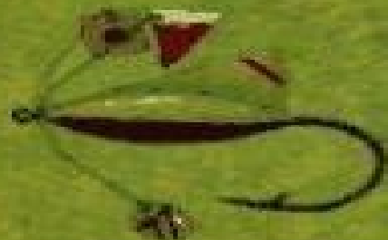
CALDER CARP ROLLER