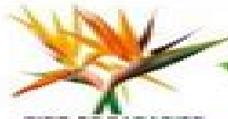
BIRD OF PARADISE