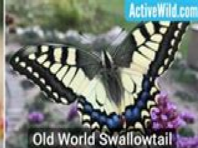
Old World Swallowtail