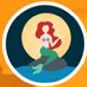
The Little Mermaid