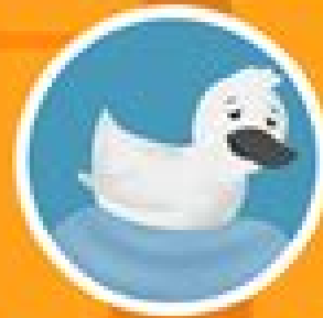
The Ugly Duckling