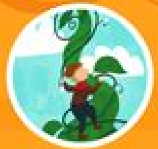
Jack and the Beanstalk