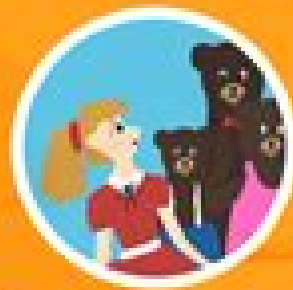
Goldilocks and the Three Bears