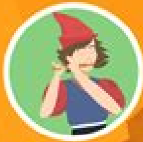
Pied Piper of Hamelin