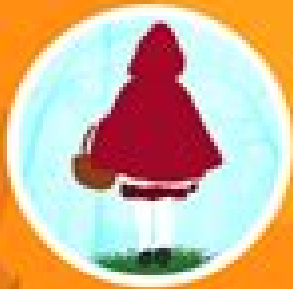
Little Red Riding Hood