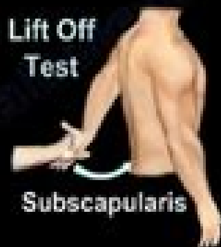
Lift Off Test