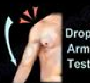
Drop Arm Test