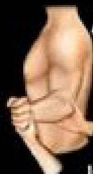
Adduction / External Rotation Test