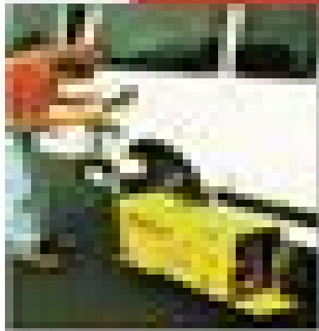
EXPOSURE PHASES OF THE LASERLINE MOBILE PERIMETER MARKING NETWORKS ELECTRONIC