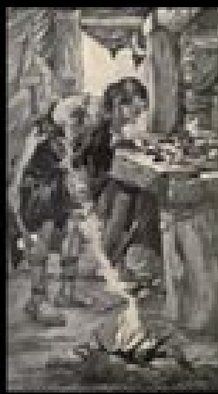
THE FLINT HEART