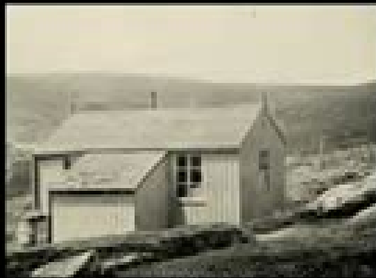
NICOLAS KIDRICOMBE'S HOUSE FROM THE RIVER