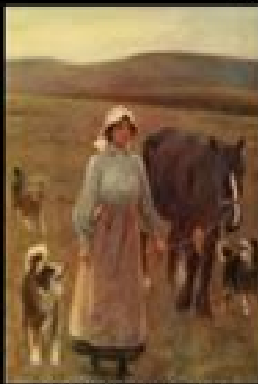
RHODA FROM THE VIRGIN IN JUDGEMENT