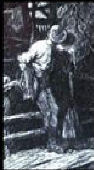
UP-ALONG AND DOWN-ALONG