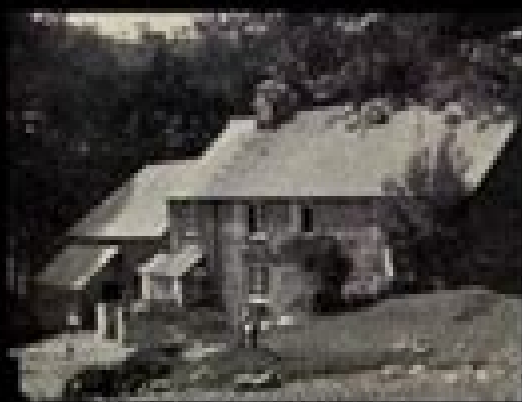
RUDDYFORD FROM THE WHIRLWIND