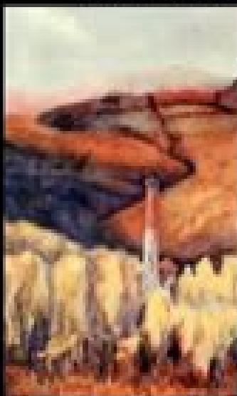
FOREST ON THE HILL