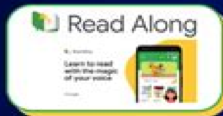
GOOGLE READ ALONG