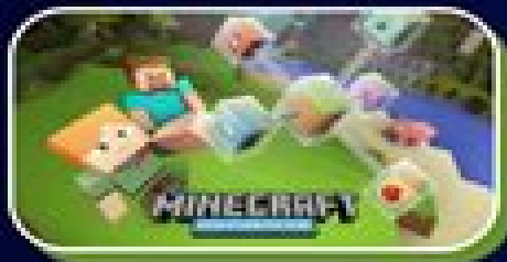
MINECRAFT - EDUCATION EDITION