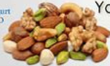
Nuts - Healthy fats & appetite suppressant