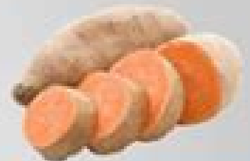
Sweet Potatoes - lower GI potatoes alternative