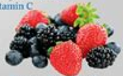
Berries - Packed with antioxidants, vitamins and fiber