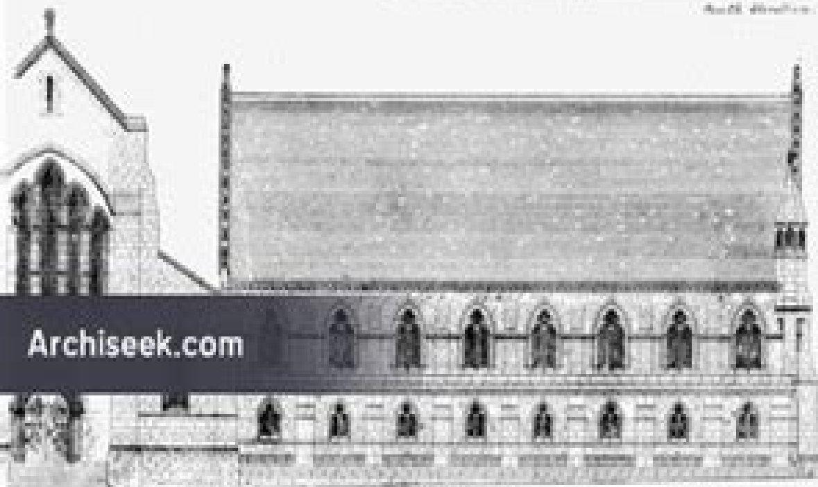
North End elevation.