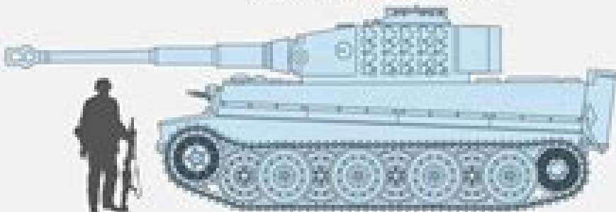
Pz. VI Tiger I Ausf. E

88-mm gun 7.92-mm coaxial machine gun 7.92-mm bow machine gun