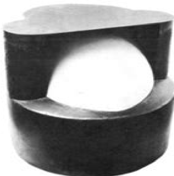
Edward Higgins, "Untitled, F56," painted steel and epoxy, 20x20x20", 1963. (Dwan Gallery)