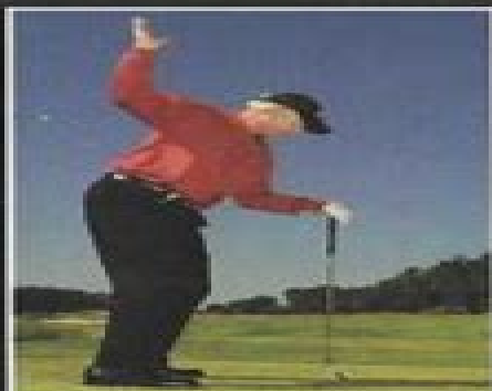
IN THE SLOT DRILL

Identify the areas in which you need help, and then let Jim McLean provide the drills to get you on the right track. Practice with a purpose, and you'll see fast results.