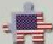
Actual piece size

Jigsaw size: 625 x 486mm (24.6 x 19.5in)