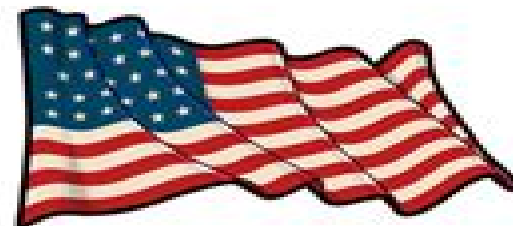
6) Union Flag (1861-1863)