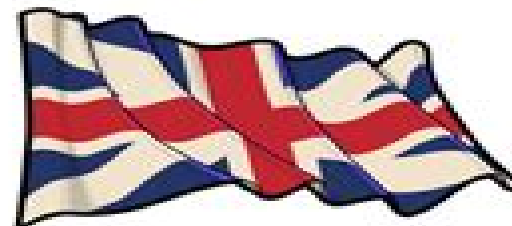
8) King's Colours