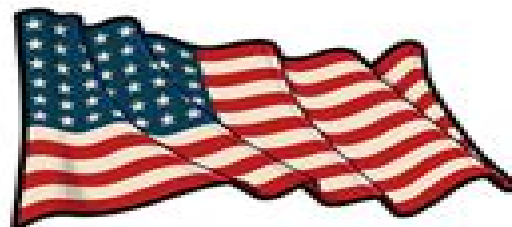
2) 48 Star WWI, WWII & Korean War