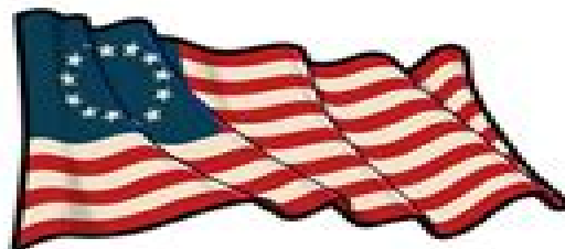
7) Betsy Ross American Revolution