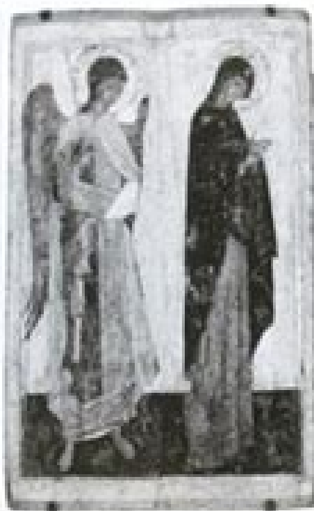
Detail of the manuscript illumination showing the two figures.

The first of the two figures is a woman, possibly a saint, standing and facing left. She is wearing a long, flowing white robe over a dark garment. Her hands are clasped in front of her. The second figure is a man, possibly a saint, standing and facing right. He is wearing a dark, long robe over a white garment. His hands are clasped in front of him. The background is a plain, light color.