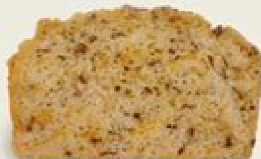
-GREEN CHILE CHEDDAR-