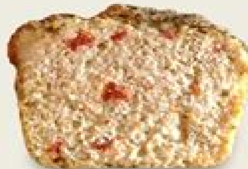
-SUN DRIED TOMATO PESTO- Flav-of-the-Moment