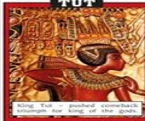
King Tut - pushed comeback triumph for king of the gods.

Tut Tut, 9, announced the togethery turn-around after high-level discussions with palace advisors. "Amun is now top god again, and his shrines and statues will be making a