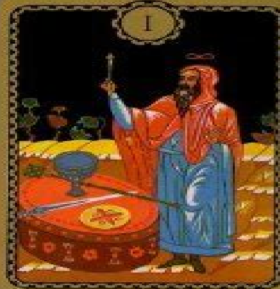
THE MAGICIAN DER MAGIER / LE BATELEUR