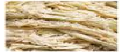
Sugar production by-products