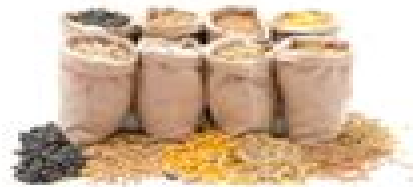
Cereals, nuts, and seeds by-products