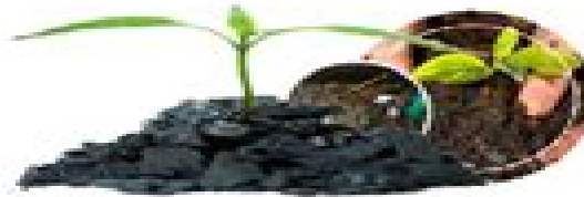
Plant nutrition application (organic fertilizer and biochar)