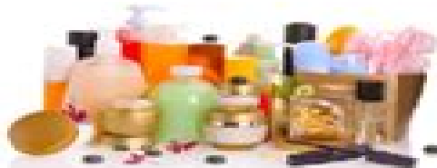
Cosmetics, pharmaceuticals, and chemicals products