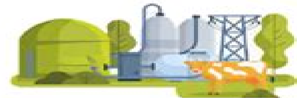
Biogas production application