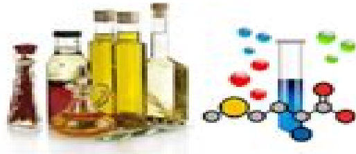
Food application (production of vinegar, oil, edible coatings, and bioactive compounds)