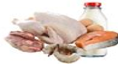
Meat, dairy, fish, and egg by-products