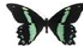
Green-banded Swallowtail ( Papilio nireus )