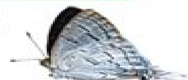
Purple-brown Hairstreak ( Hypolycaena philippus )