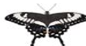
Emperor Swallowtail ( Papilio ophidicephalus )