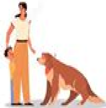
LOVE FOR ANIMALS