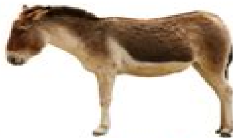
Kiang Equus kiang