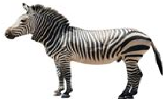
Mountain Zebra Equus zebra