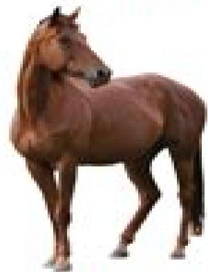
Wild Horse Equus ferus

GRASSES, SEDGES, BUDS, FRUITS, ROOTS, and BARK