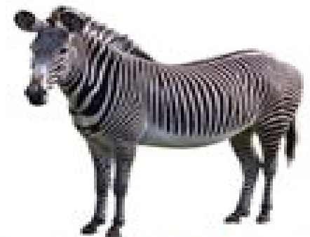
Grévy's Zebra Equus grevyi