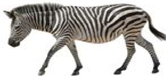
Plains Zebra Equus quagga