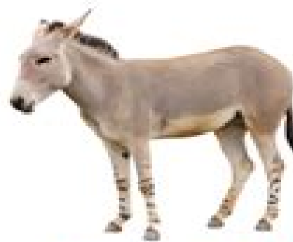
African Wild Ass Equus africanus