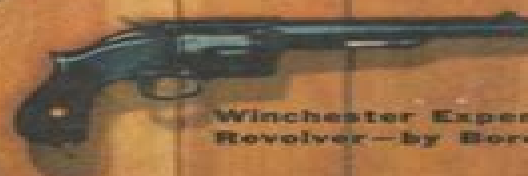
Winchester Experimental Revolver—by Borchardt