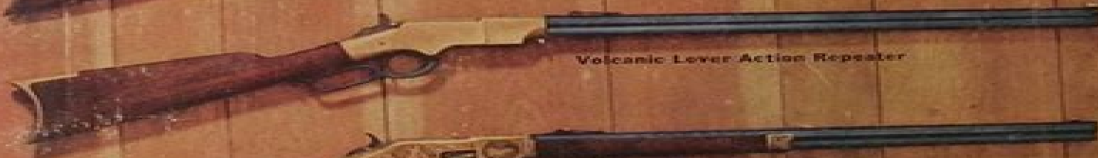
Volcanic Lever Action Repeater