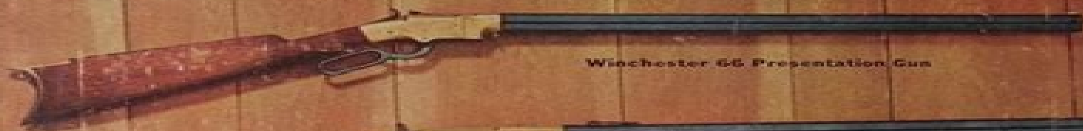
Winchester 66 Presentation Gun