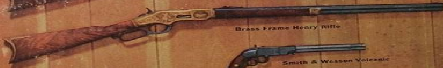
Brass Frame Henry Rifle