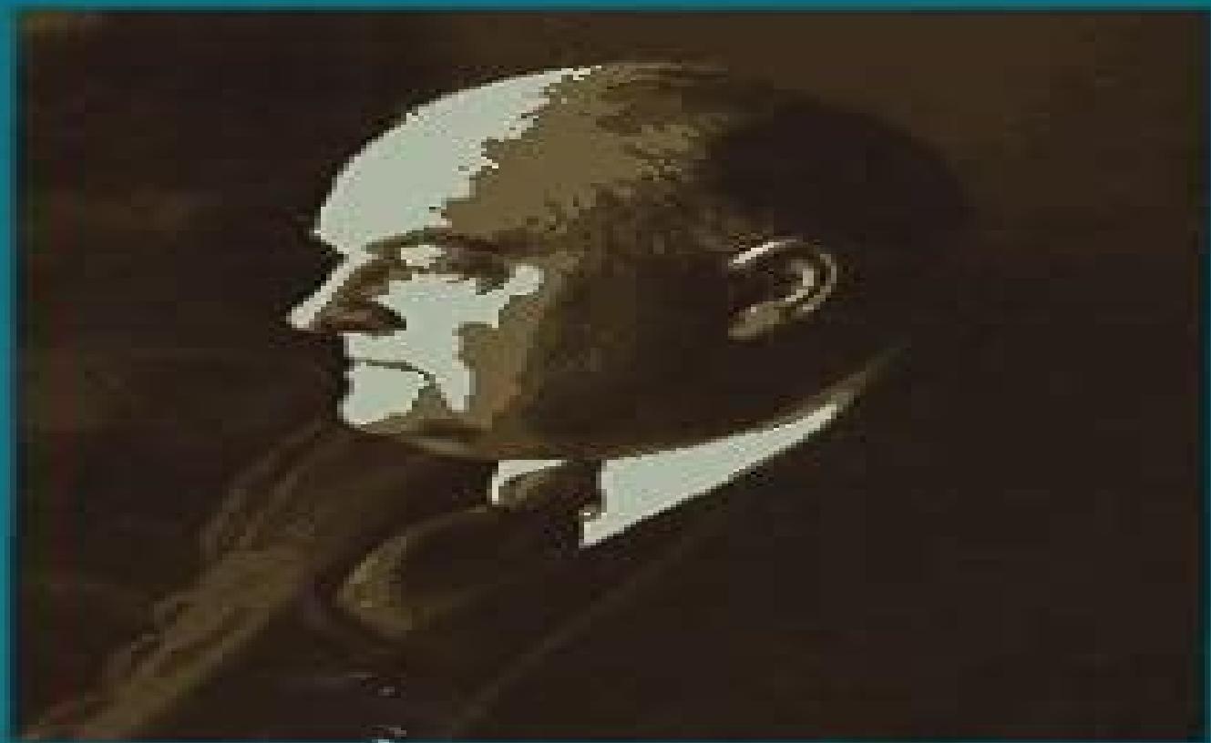
Portrait of Edmund Wilson by Robert Rauschenberg