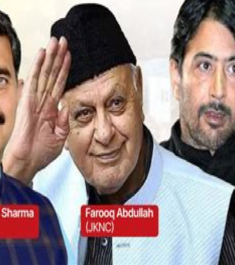
Farooq Abdullah (JKNC)