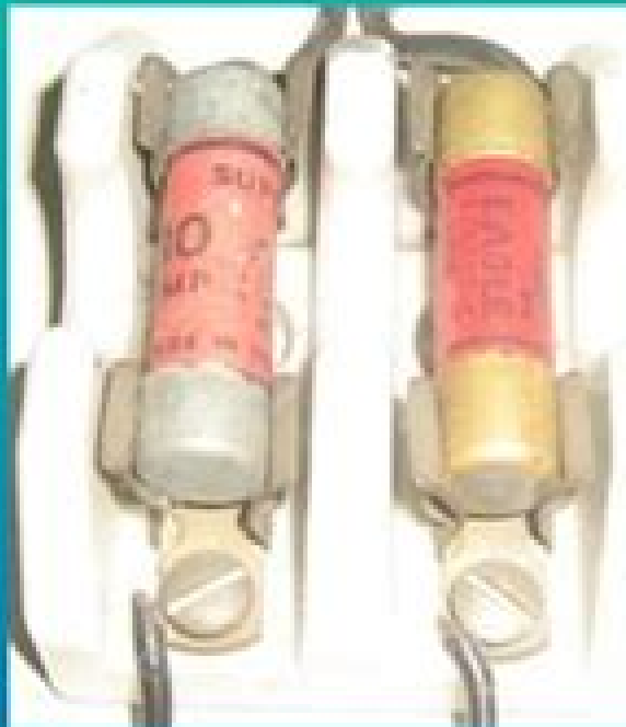
Porcelain Fuse Cut-out, One Circuit