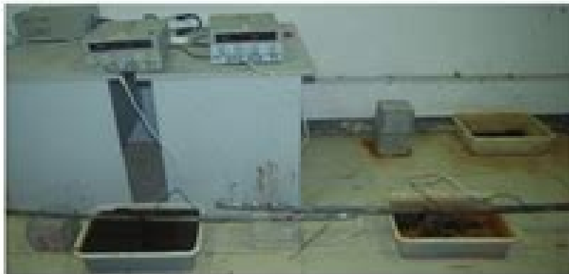
The electrochemical accelerated corrosion of P1 and P2 in situ