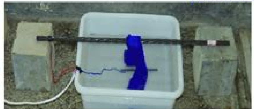
The electrochemical accelerated corrosion of S1 in situ