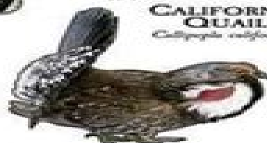
CALIFORNIA QUAIL Callipepla californica