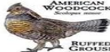
RUFFED GROUSE Bonasa umbellus