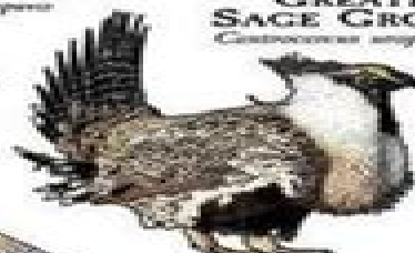
GREATER SAGE GROUSE Centrocercus urophasianus