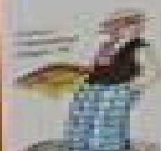
Person Book of Games Page 100