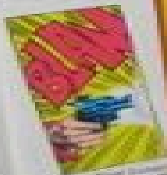
Hand Book of Games Page 100