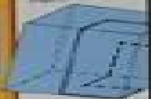
Blue Book of Games Page 100