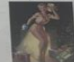
Beach Scene 1950, Gil Elvgren, Pin-up Art

December | December | Décembre | December | 12/01