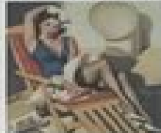
Beach Scene 1950, Gil Elvgren, Pin-up Art