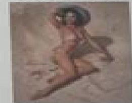
Beach Scene 1950, Gil Elvgren, Pin-up Art

September | September | Septembre | Szeptember | 9/01