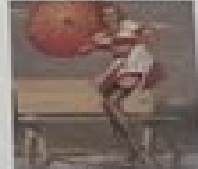
Beach Scene 1950, Gil Elvgren, Pin-up Art