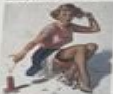
Looking for Trouble 1950, Gil Elvgren, Pin-up Art

January | Januar | Janvier | Január | 1/01