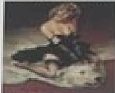
Black and White Beach Scene 1950, Gil Elvgren, Pin-up Art

February | Februar | Février | Február | 2/01