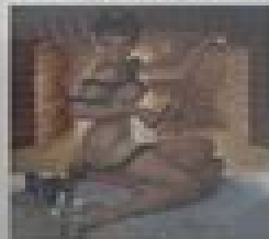
Beach Scene 1950, Gil Elvgren, Pin-up Art

November | November | Novembre | November | 11/01