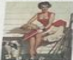
Beach Scene 1950, Gil Elvgren, Pin-up Art