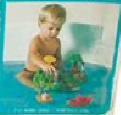
Fun in water - fun on land - fun in the sun.