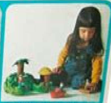
Hours of fun with Gilligan's floating island.