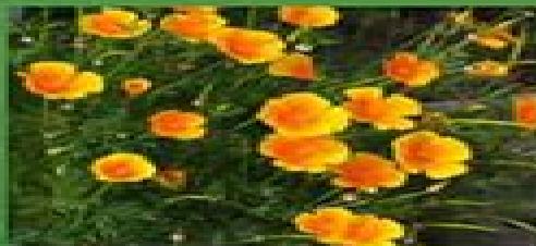
2. CALIFORNIA POPPY (ESCHSCHOLZIA CALIFORNICA)