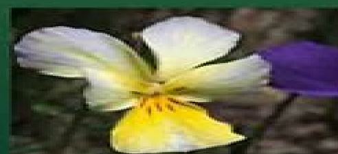
9. MOUNTAIN VIOLET (VIOLA PURPUREA)