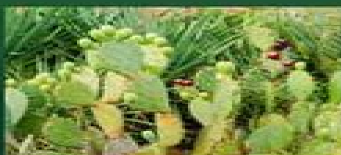
8. COASTAL PRICKLY PEAR (OPUNTIA LITTORALIS)