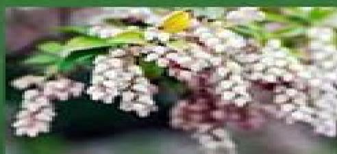
5. MANZANITA (ARCTOSTAPHYLOS)