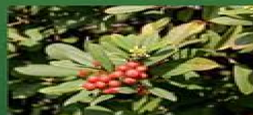
6. COFFEEBERRY (FRANGULA CALIFORNICA)