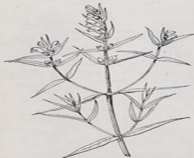
Fig. 481. MELAMPYRUM PRATENSE